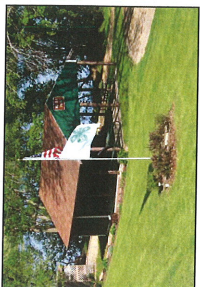
The shelter house was donated to the park by the East Chain Sportsmen's Club.

This is the first park in the County system. The County Board of Commissioners accepted the Holy Family Subdivision Park and dedicated it for public use as a park and access to East Chain Lake. There are approximately two acres of land in the park, a shelter house, playground equipment, lake access, swimming, fishing, picnicking. The shelter house was donated to the park by the East Chain Sportsmen's Club.