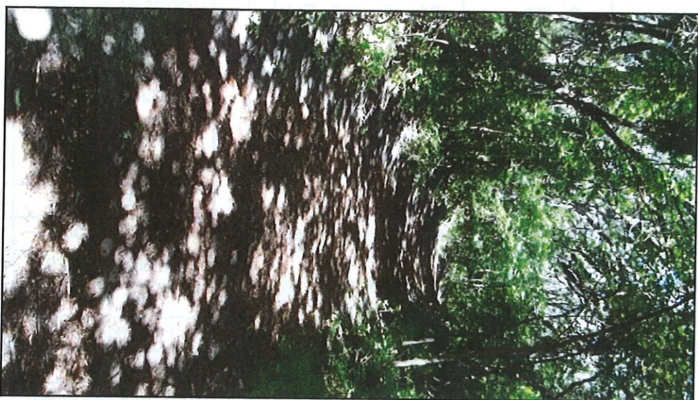
"Take only pictures, leave only footprints."

Martin County invites you to visit our beautiful local parks. Whichever park you prefer, enjoy your visit and respect what the county maintains for all its residents.