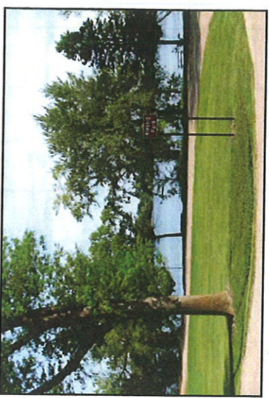
This property was acquired by the County park system in 1968 when the road was changed and the land given to the county. This is a small park with boat landing access to Iowa Lake, good shore fishing and picnicking.