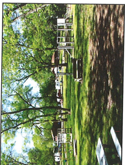
The park features 9 modern camp sites with water and electrical hook-ups along with a variety of primitive campsites.

Previously pasture land, this park was purchased from the Truman JCs in 1971. This is a well-developed park with RV and tent camping. There is a variety of playground equipment, from swings to horseshoe pits. Hiking the trails and steep banks to the lake offer viewing of wildlife and natural vegetation. The park features 9 modern camp sites with water and electrical hook-ups along with a variety of primitive campsites.